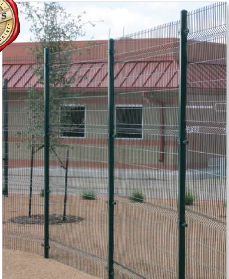
8 ft. Tuf-Grid® Welded Wire, Green