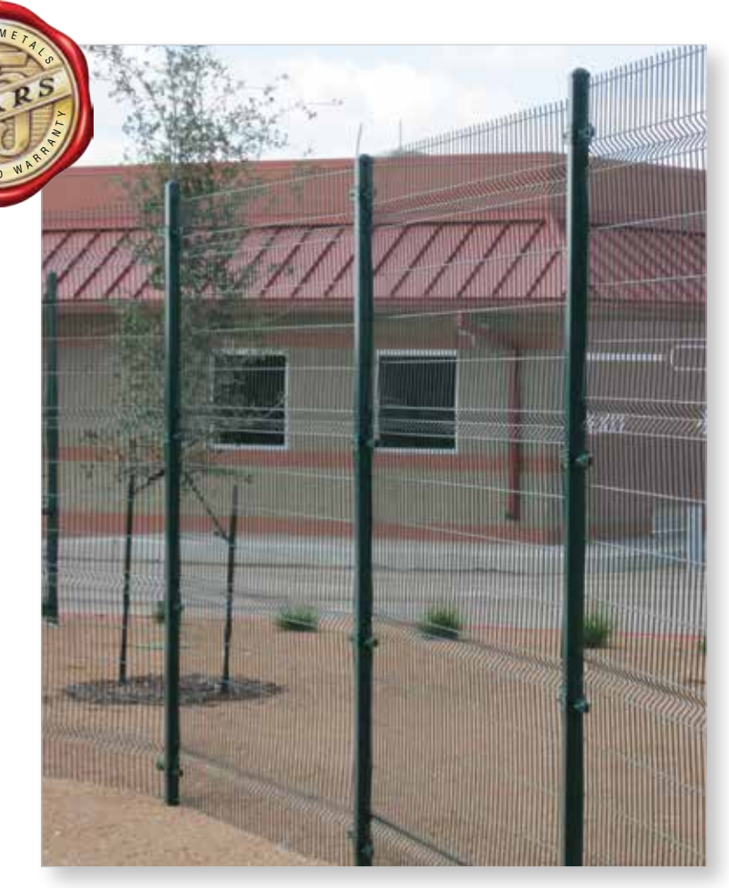
8 ft. Tuf-Grid® Welded Wire, Green

Tuf-Grid's economy bracket allows the panels to be installed on the "face" of the post, reducing the number of brackets needed for installation. The wrap around design securely joins two panels to the post for a quick and easy installation. Economy brackets are available for 2 in., 2¼ in. and 3 in. post applications only.